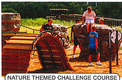
NATURE THEMED CHALLENGE COURSE