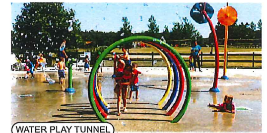
WATER PLAY TUNNEL