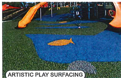
ARTISTIC PLAY SURFACING