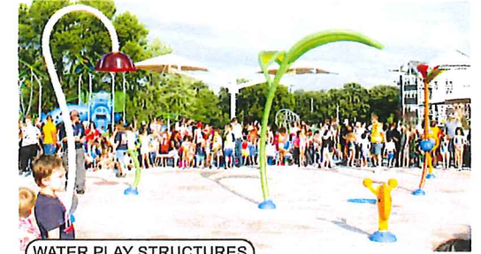
WATER PLAY STRUCTURES